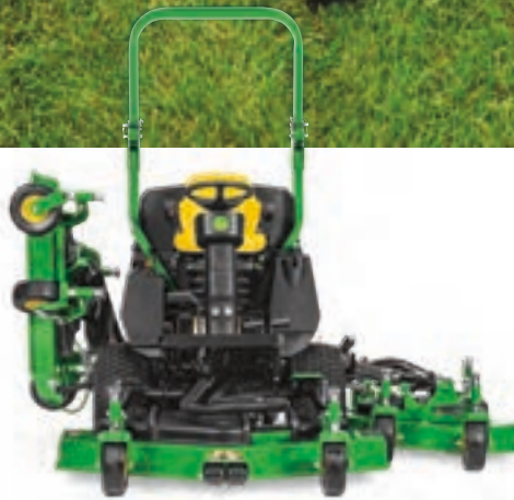
94 in. with center deck and either side deck