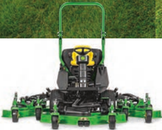
62 in. with center deck only