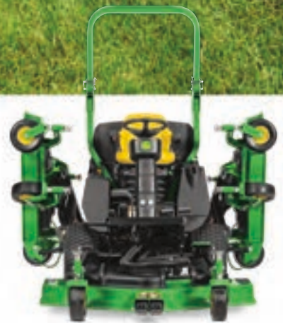
84-in. transport width with both sides folded in