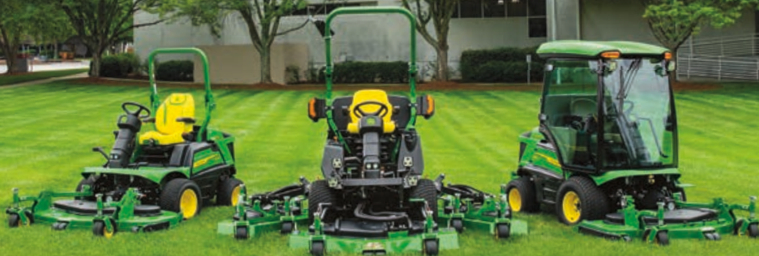
1570 TerrainCut™ Front Mower