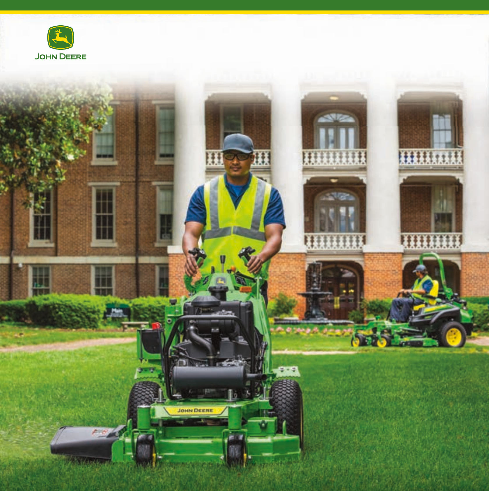
W36R Commercial Walk-Behind Mower