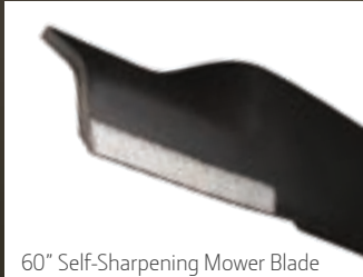
60" Self-Sharpening Mower Blade